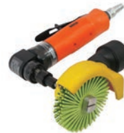
Radial Shroud 3" for Radial Bristle Discs