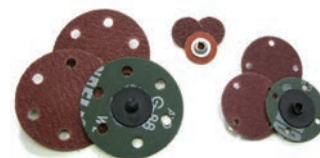
Quick Change Discs