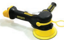
5" Two Hand