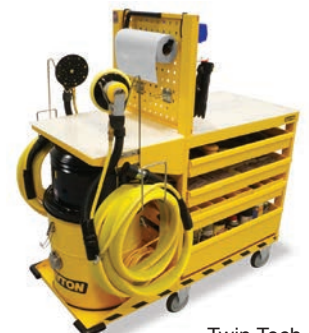
Twin Tech Mobile Workcenter