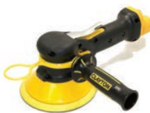
6" Two Hand