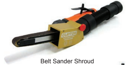
Belt Sander Shroud

The Universal Shrouds dramatically decrease your Total Cost of Ownership (TCO) because they can be easily moved from one tool to another. As your preferred tool manufacturer changes, Clayton Universal Shrouds can continue to provide the same outstanding performance year after year.