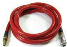
Compressed Air Lines 1/4" to 3/4" custom lengths available