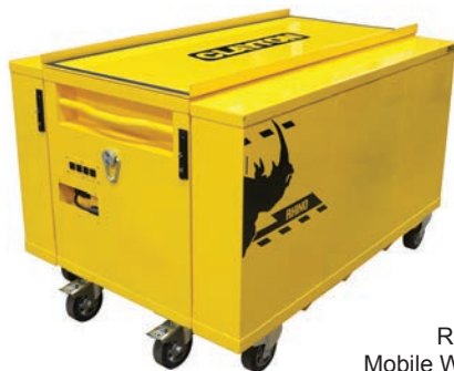
Rhino Mobile Work Center

Clayton manufactures various storage solutions that provide tool control and mobility. Designs and features of these kits are all drawn from requirements of the military and commercial aerospace community. All components are heavy duty industrial grade, and are built to last.