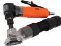
Clear Revolution Shroud 1" 2" & 3"