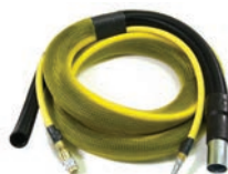
Air/Vac Work Hoses