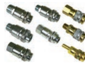
We carry a complete line of hose fittings

Available in a variety of lengths and configurations, all Clayton dustless sanding hoses incorporate features specifically designed for dustless sanding. Air / Vac Work hoses and Extension hoses supply compressed air to tools, and allow unrestricted flow of dust & debris back to the vacuum. All vacuum hoses and cuffs are conductive to eliminate buildup of static electricity.