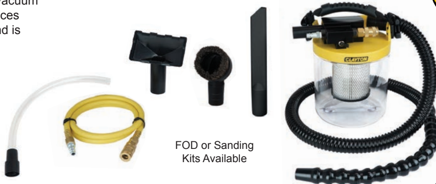
FOD or Sanding Kits Available