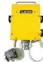
Air/Vac Distribution Box