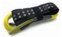
Hose Support Belts