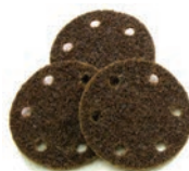
Quick Change Discs