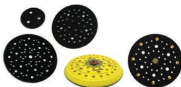
Pad Protectors and Interface Pads