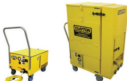
DustMaster Electric HEPA Vac

Two color shadow boxed tool control foam in CTK is customized based on tool configuration.