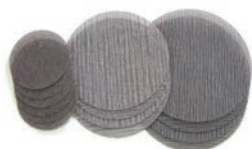
DustMaster Screen Abrasive