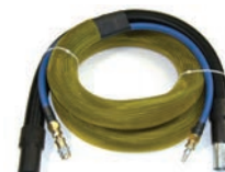
Air/Vac Extension Hoses