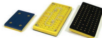
Backup Pads designed specifically for vacuum sanding.