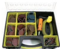
Quick Change Grinder Kits