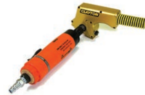
Cutoff Saw Shroud 2" & 3"