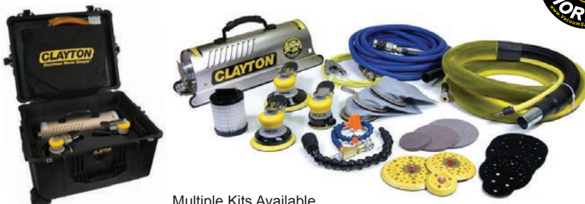
Multiple Kits Available