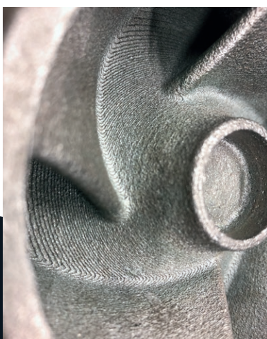
Figure 3 (above)

The cast part made with a conventionally manufactured impeller core has deficiencies and requires laborious post-processing.