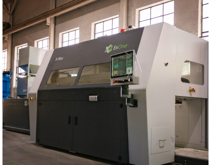
A large print is removed from the sand print bed, left, of the S-Max sand 3D printing system at Kore Mart, right